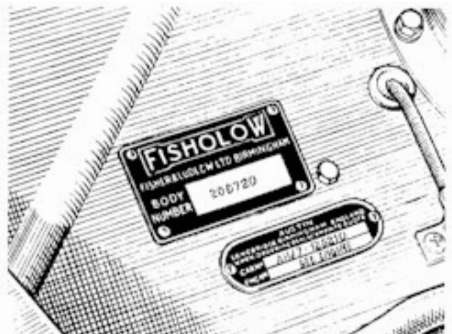
The Chassis Number is stamped on a plate secured to the right-hand side of the fire wall.